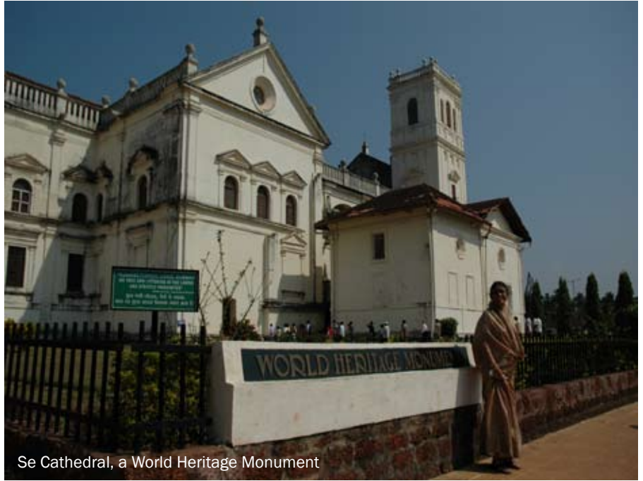
Se Cathedral, a World Heritage Monument

Building a better Asia future leaders retreat 2008