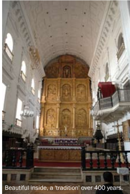
Beautiful inside, a 'tradition' over 400 years.