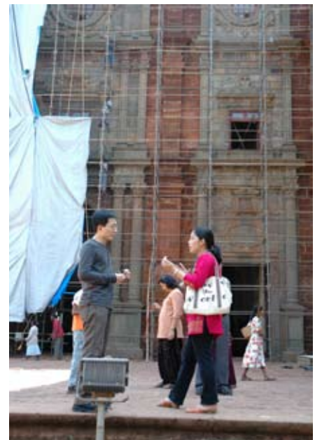
A scene of interaction - hopefully leading to prosperous Asia