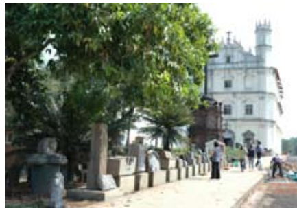
Hindu cultural relics are collected together with Christianity