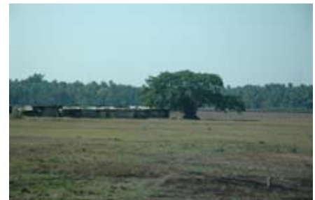
Local farmers' hut under the shade of a large raintree