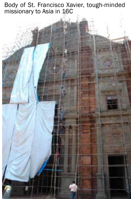
Indian people make much effort to conserve the heritage