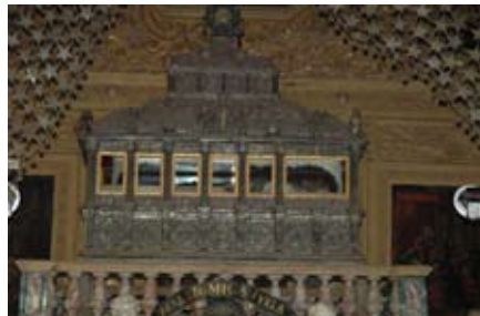
Body of St. Francisco Xavier, tough-minded missionary to Asia in 16C