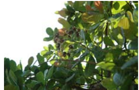
Cashew nuts, but can not eat yet